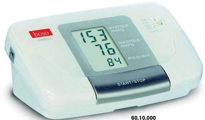
60.10.000 BoSo Medicus