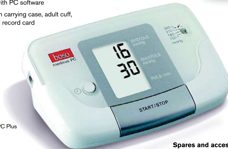
60.17.000 BoSo Medicus PC Plus