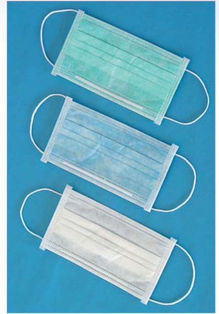
Standard Face Mask, with loops 20272

232625 £47.85 Facemate, 1 with shield and loops Supplied in green, pack of 25