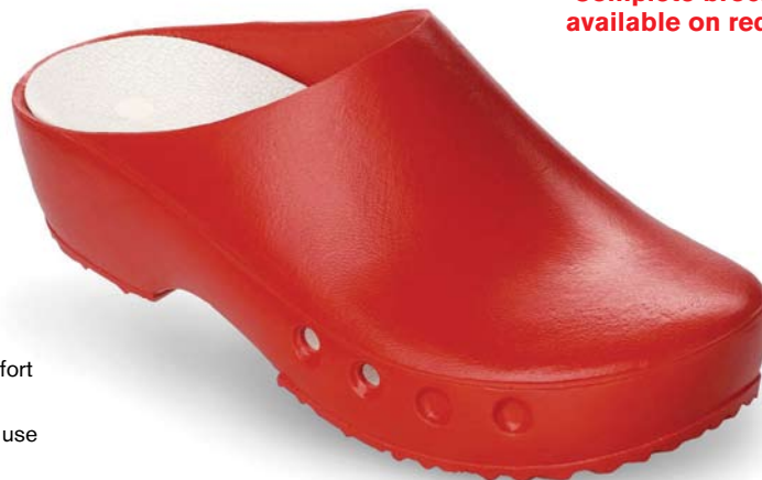
Without heel strap