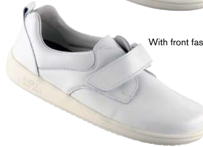
With front fastening Velcro strap