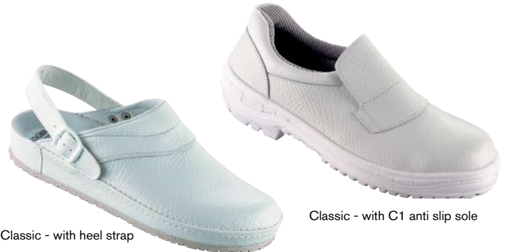
Classic - with heel strap

5 0027 00 00 Washable up to 30°C, size 41 - 46 £7.50