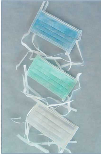
Standard Face Mask with ties 20270