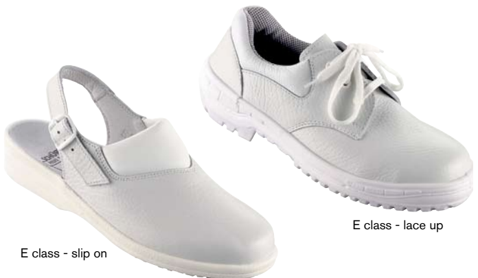
E class - slip on