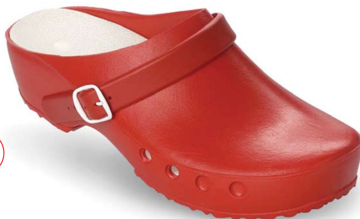
With heel strap