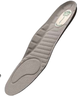
Replaceable inner sole